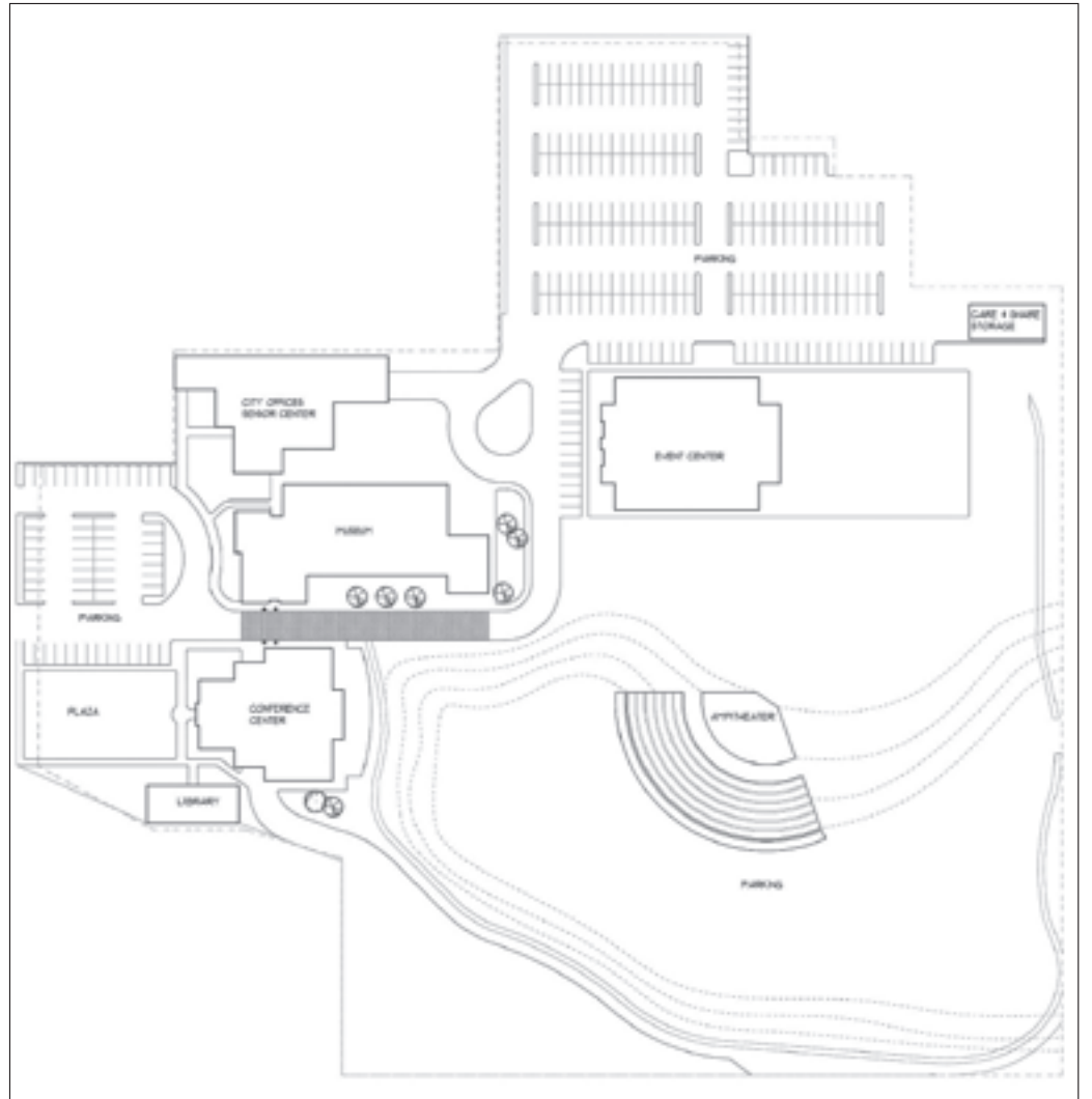
A drawing of the Kanab Civic Center Site Plan. A public meeting is being held on Monday, September 21 at 5 p.m. in the Commission Chambers for input on the plan.

Additional information about staying safe outdoors can be found at the National Weather Service website http://www.lightningsafety.noaa.gov/outdoors.shtml